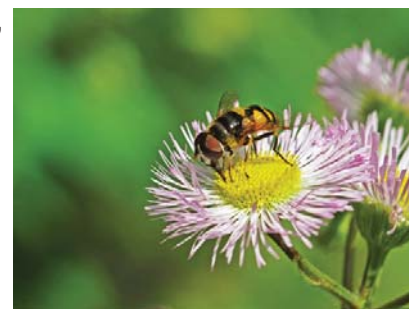
New England Aster

To learn more about the Parkway green space visit www.hgparkway.ca/sustainability .